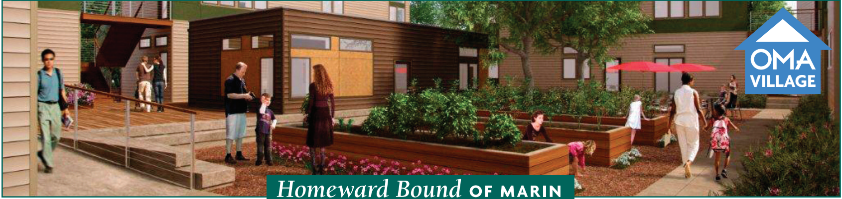
Homeward Bound OF MARIN

All funds raised during this "Immediate Public Opportunity" are tax-deductible and will be used to build the Oma Village family housing site in Novato, CA. The above-named stockholder does not actually own stock or shares in the nonprofit public charity "Homeward Bound of Marin" or any of its assets. These nonprofit IPO shares are a philanthropic equity investment that allows shareholders to "take stock in their community."